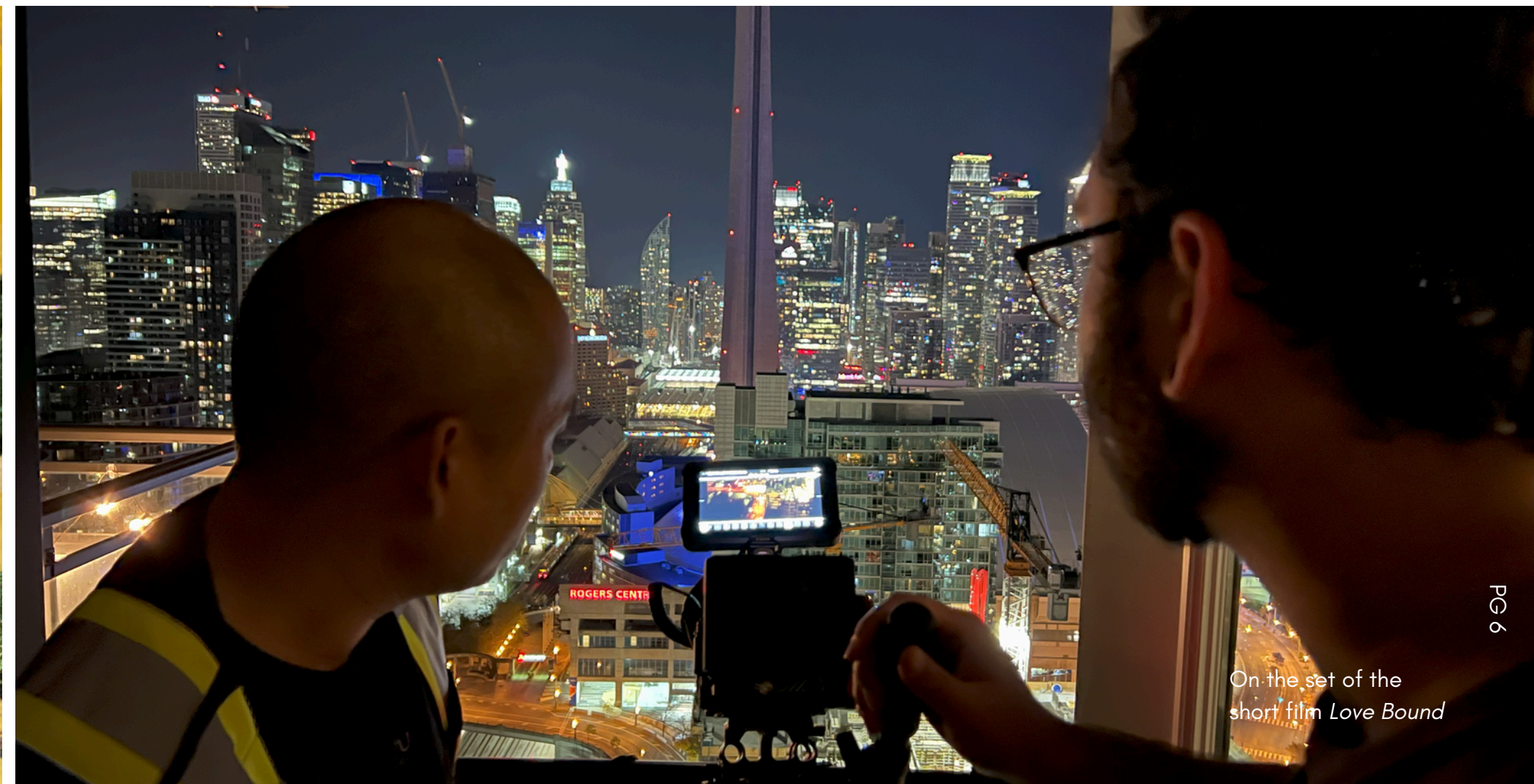
On the set of the short film Love Bound